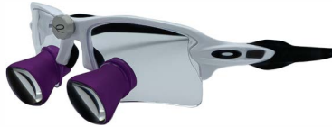
Flak 2.0 XL